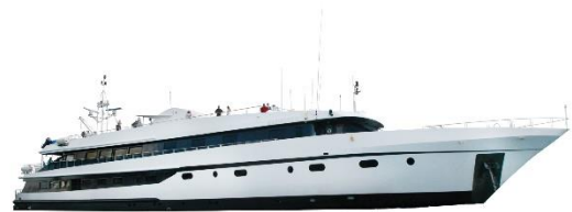
360° SUN DECK